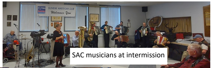
SAC musicians at intermission