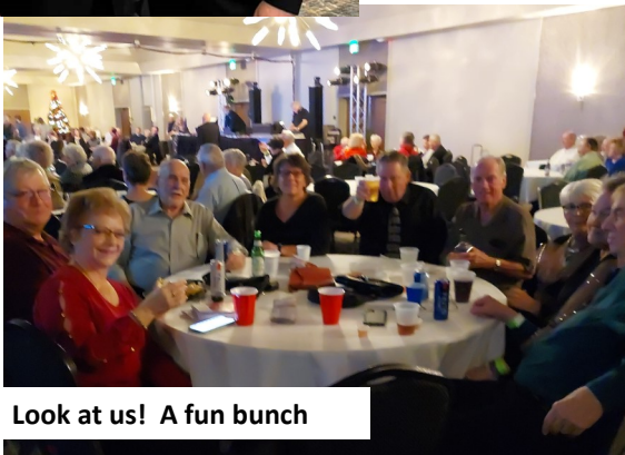
Look at us! A fun bunch