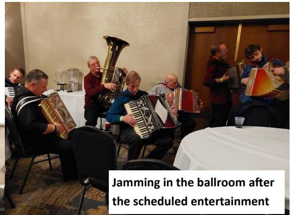
Jamming in the ballroom after the scheduled entertainment